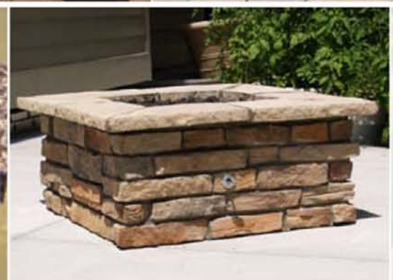
A. Athena Cocktail Finish: Nova